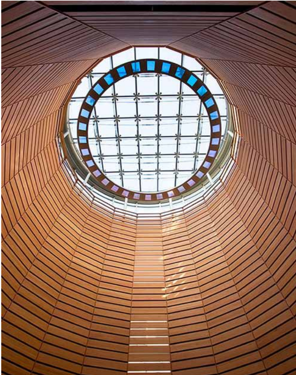
Timber hall

Embassy of Canada with rental offices, retail area and residential spaces as PPP-Project 2006