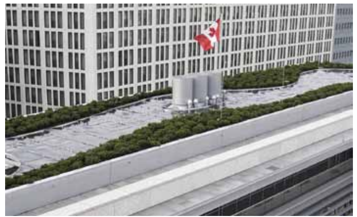
Green Roof with Mackenzie River