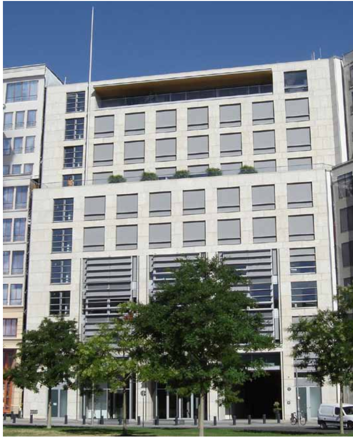
View from Leipziger Platz

Embassy of Canada with rental offices, retail area and residential spaces as PPP–Project 2006