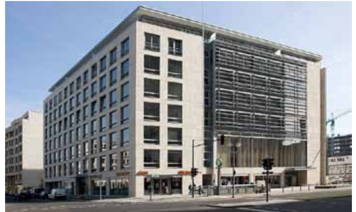
View from Ebertstrasse (Photo © Canadian Embassy Berlin)