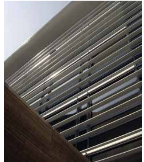
Façade of courtyard

Large window surfaces and façade cladding out of clear-cut Manitoba Tyndall Stone make the very welcoming building stand out, even in a group of new structures. The reception area of the Embassy is located on