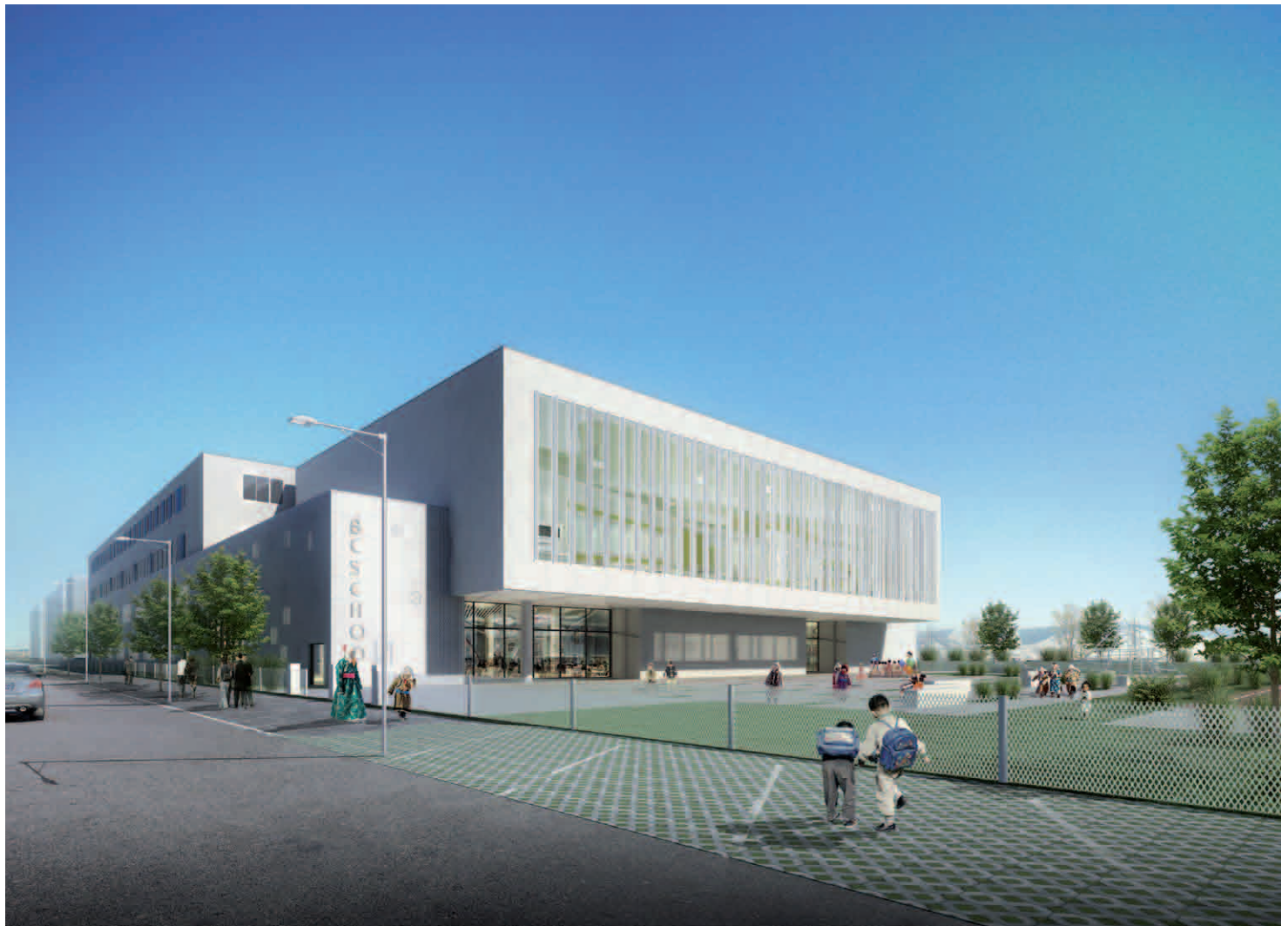
Perspective School Main Entrance

New international primary school in Ulaanbaatar, Mongolia 2012 – 2013