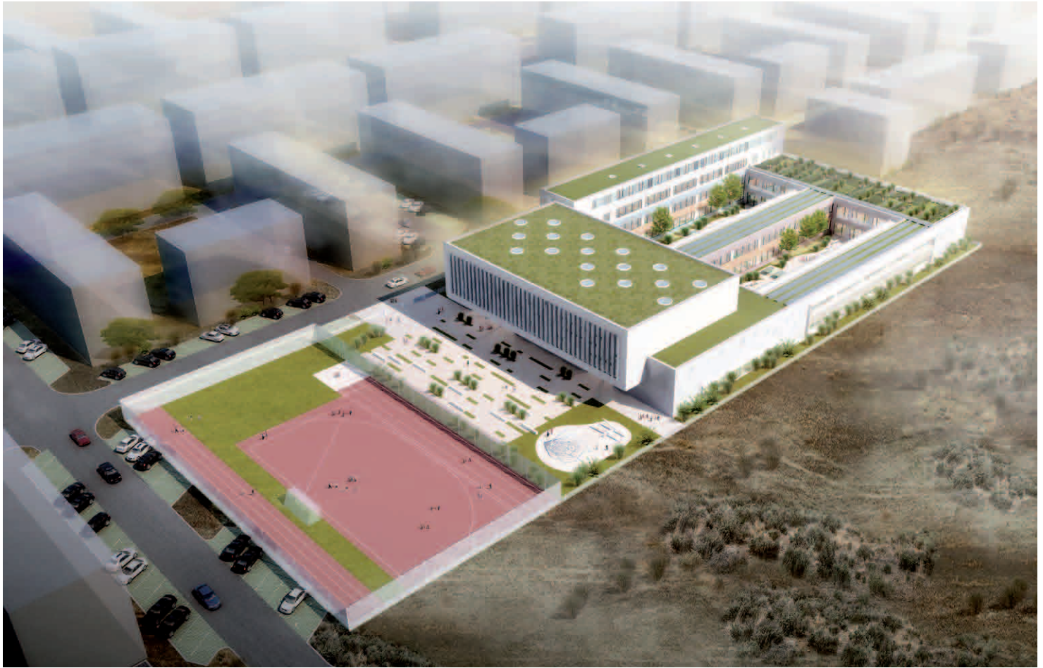
Birds Eye Perspective

New international primary school in Ulaanbaatar, Mongolia 2012 – 2013