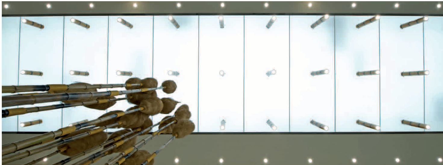
Light ceiling with illuminated bamboo sticks