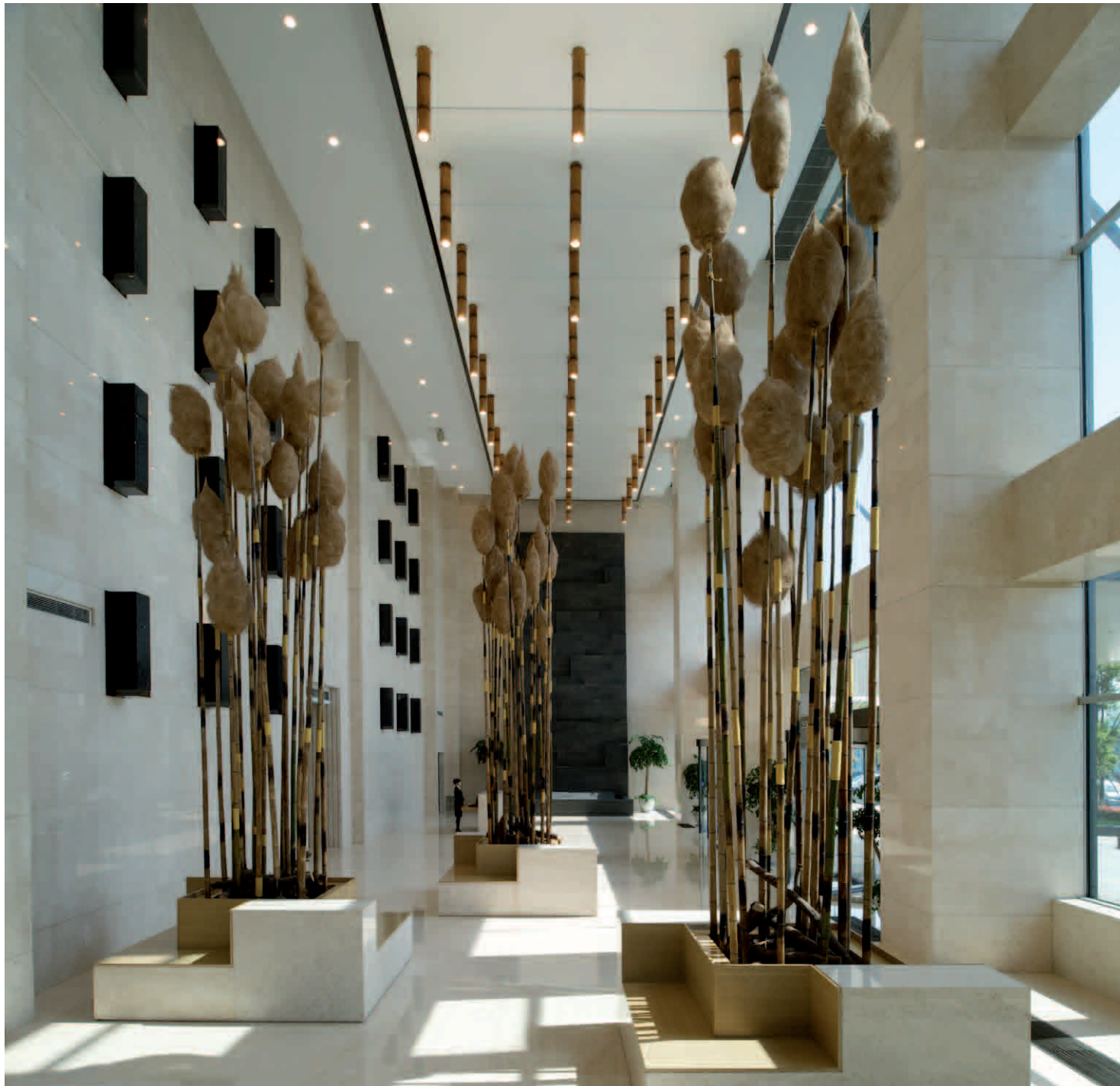
Entrance hall