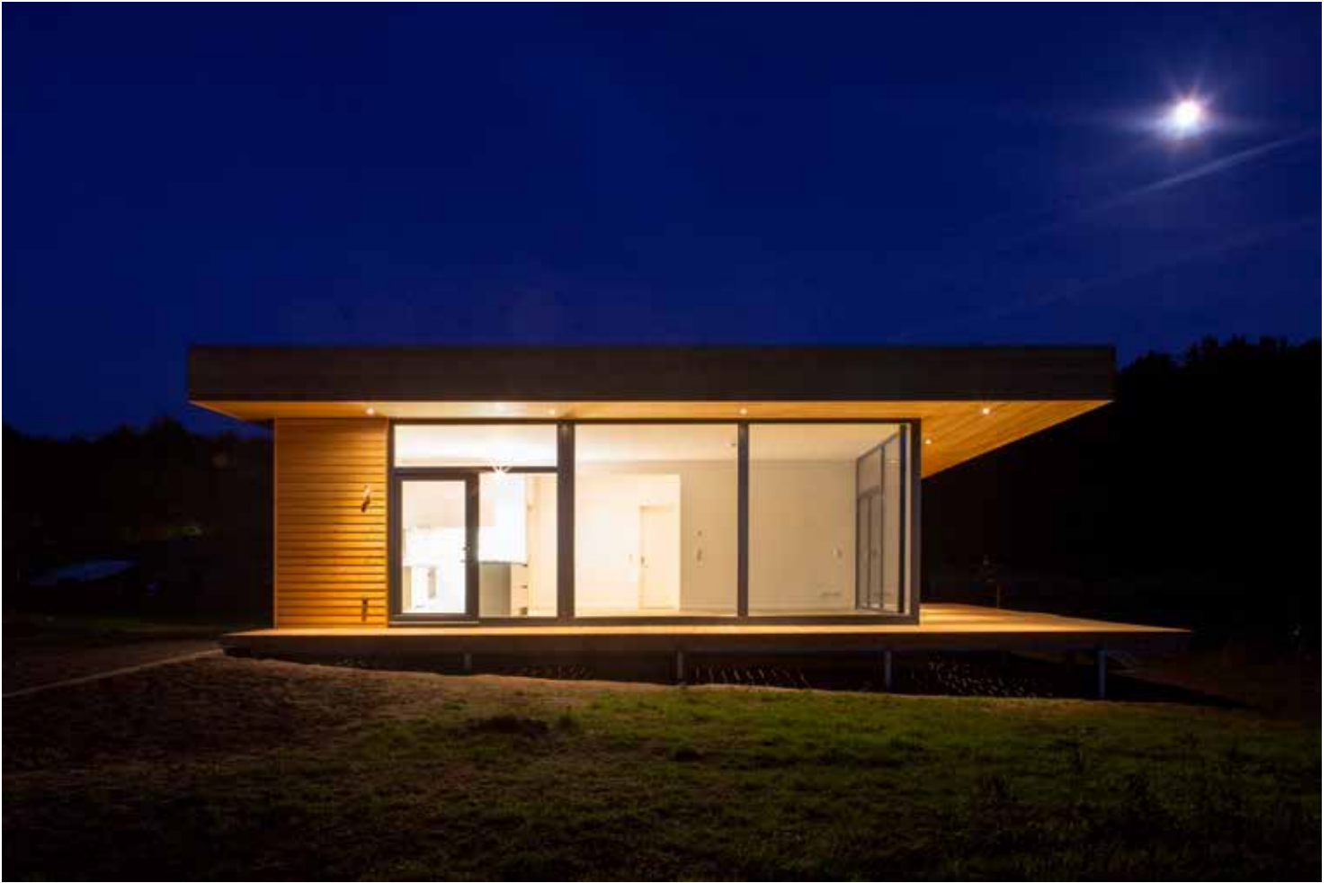
West perspective

Cost-efficient building with wood in the countryside of the district Oberhavel, Germany 2014