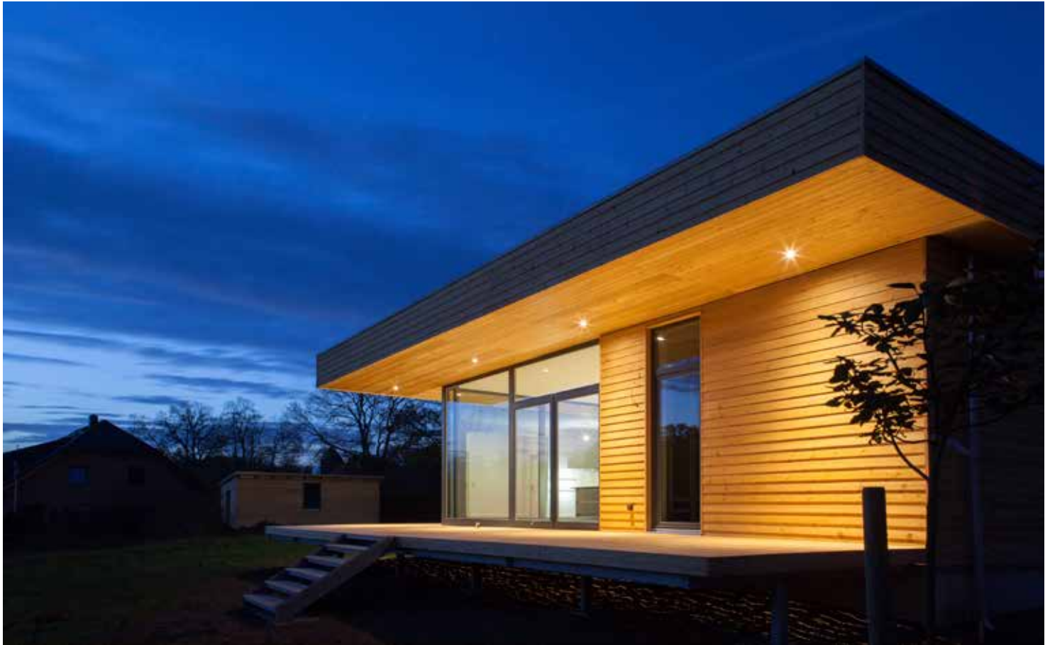
South facade with terrace

Cost-efficient building with wood in the countryside of the district Oberhavel, Germany 2014